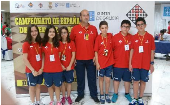
CASTILLA LA MANCHA